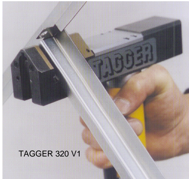
TAGGER 320 V1